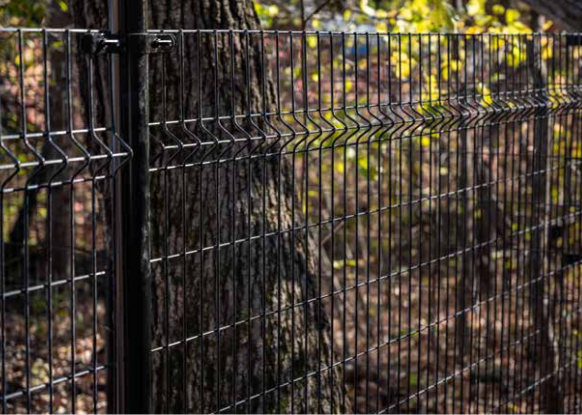
Rampart 284 Double Wire