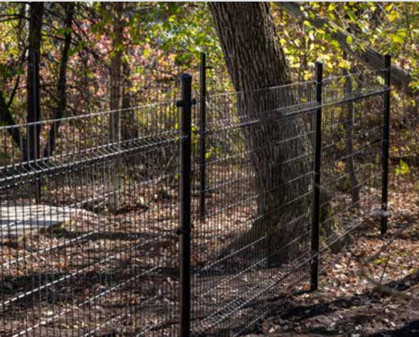
Rampart 284 Double Wire