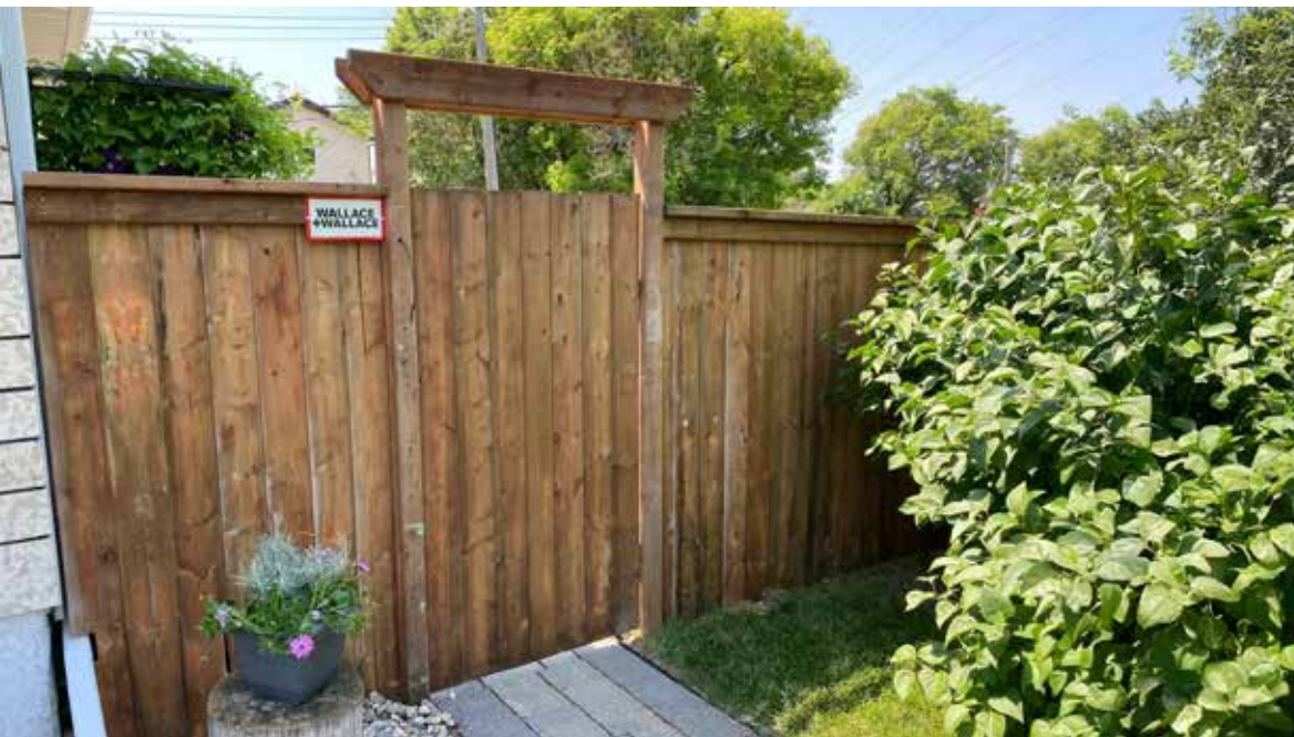
Wood Gate with Header