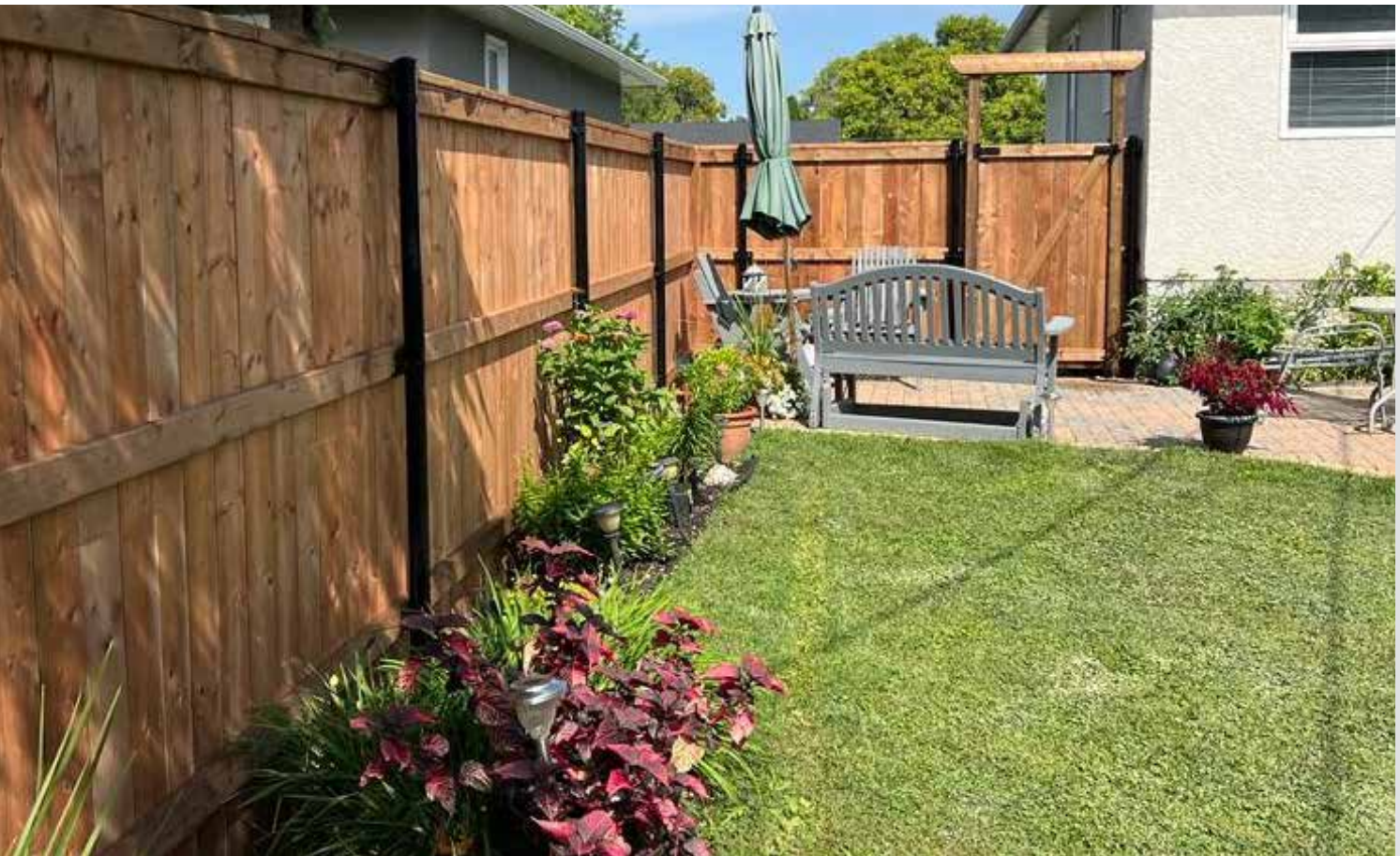
Powder-Coated Black Steel Posts