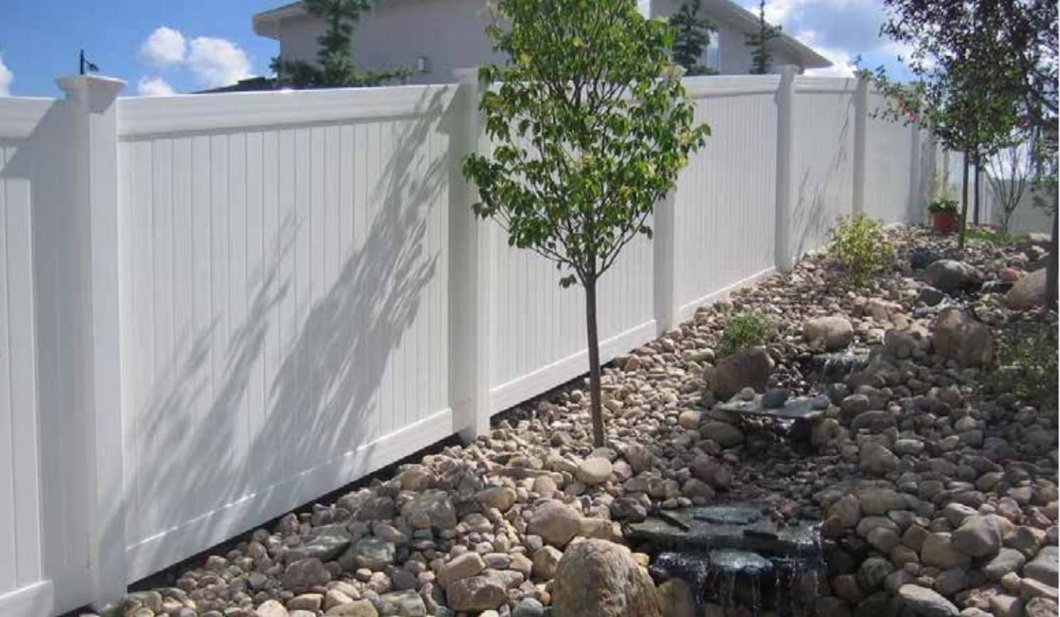
Tahoe 1 Privacy Fence