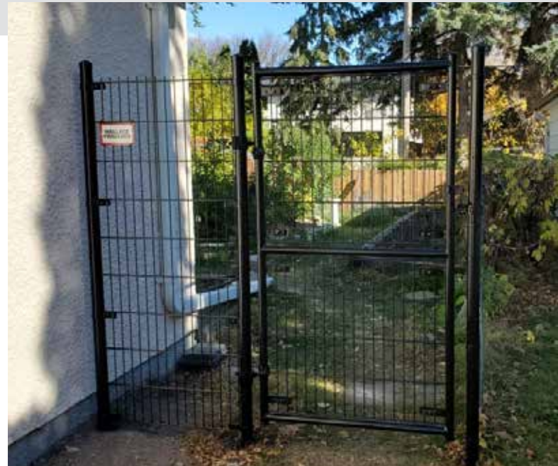
Rampart 284 Double Wire Gate